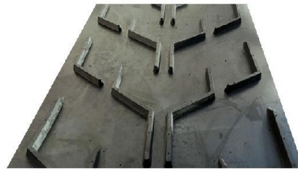
Tabel dimensiuni :