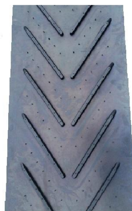
Tabel dimensiuni :